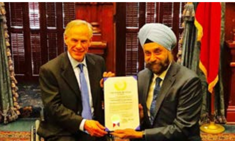
Increased flexibility in an era of lower oil prices has allowed the United States to use its resources to forge closer ties with partners like India. Pictured here, Texas Governor Greg Abbott is handed a cargo manifest for the first U.S. crude oil shipment to India.

Lower oil prices immediately challenge a set of countries with national economies heavily skewed toward resource revenues. These countries had enjoyed windfalls from high prices but did not diversify their economies or build robust institutions to cope with shrinking revenues. Faced with the prospect of declining resource wealth, they are at risk of societal and economic instability. Venezuela is the most extreme example of this downward spiral. Petróleos de Venezuela, S.A. (PDVSA) , the state-owned oil company, is responsible for a significant percentage of Venezuela's gross domestic product and tax revenue, but it has seen years of declining production as a result of underinvestment and now faces tremendous challenges to sustain output in the low-price environment. 11 In this context, President Nicolás Maduro has delivered authoritarian policies and faced enormous domestic unrest. The United States responded to Maduro's harsh rule with financial sanctions, and China has pulled back its long-standing financial support, further darkening the country's economic outlook.