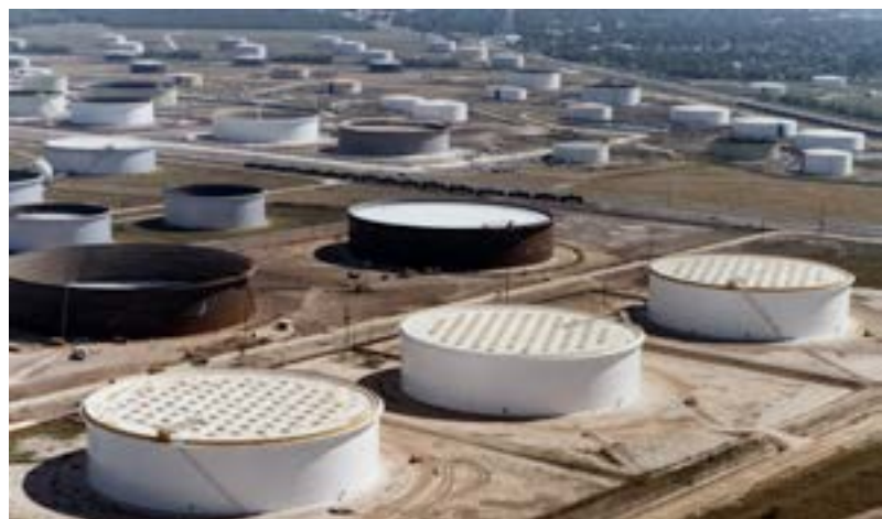
Stockpiles like the U.S. Strategic Petroleum Reserve can preserve stability in a lower-oil price world and help facilitate long-term planning. Pictured above are storage tanks that make up part of the U.S. Strategic Petroleum Reserve in Texas.

Reaffirm the U.S. commitment to protecting the integrity of global oil markets. Successfully keeping oil markets open will prevent any price shocks or major adjustments to supply. A stable market should also improve price predictability and facilitate long-term economic planning, reducing the risk of budgetary problems that could provoke instability and external malicious activity in poorer oil-producing countries. Thus, U.S. efforts should focus on ensuring stability and predictability in markets by deterring major disruptions. The United States should, at the same time, engage other relevant powers, including China, on developing greater burden-sharing of this global responsibility. Efforts should include more engagement through the IEA, with both traditional U.S. partners who have relied on the U.S. Strategic Petroleum Reserve as a buffer and rising