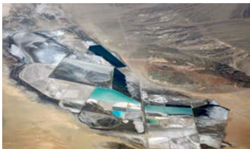
The move toward clean energy could alter the geopolitical landscape of natural resources and create a competition for access to materials, such as lithium and cobalt, necessary for clean energy applications. Pictured above, a lithium mine in Nevada.

In the case of lithium, resources are heavily concentrated in China and Australia as well as the so-called Lithium Triangle of Argentina, Chile, and Bolivia. Meanwhile, nearly half of global cobalt reserves are located in the Democratic Republic of the Congo, while China accounts for around 83 percent of current rare earths supply. Though overall global supplies are ample, the concentration of resources in select countries, many of which have faced political instability that has threatened mine output, raises questions of supply vulnerabilities and risks of a mercantilist approach to development and trade of these resources. By way of example, China in 2010 temporarily cut off rare earths exports to Japan following Japanese detention of a Chinese fishing boat captain in an area disputed by both countries. The trade action came at a time when rare earths supplies were already constrained by Chinese export quotas, which were eventually challenged in and overturned by the WTO in favor of opponents that included the United States and Europe. There are fears that China may be willing to use its dominance in rare