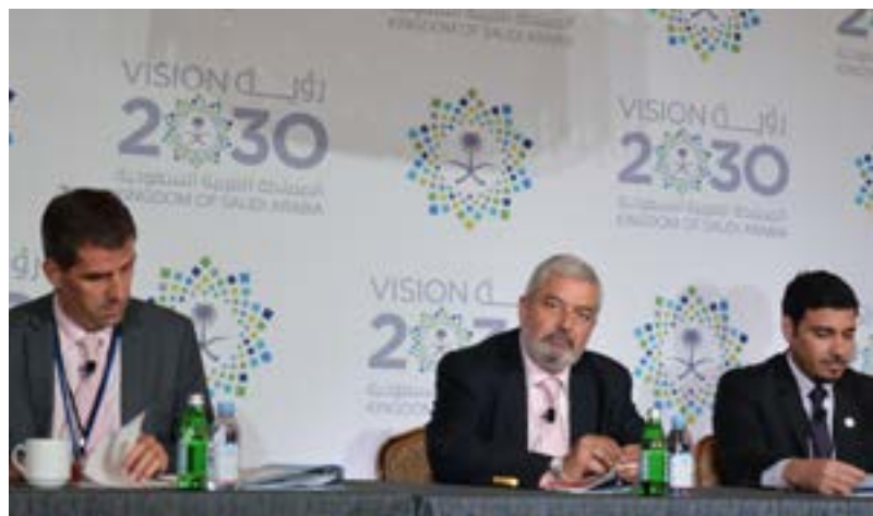
The persistence of lower oil prices is forcing producer states to diversify their economies. The Saudi Vision 2030 plan is a particularly ambitious example. Pictured above is a panel on Saudi Vision 2030 and the United Nations' Sustainable Development Goals 2030.

Other major consumer countries, especially China and, to a lesser extent, India, will also consider whether and to what extent they become, over time, more involved in guarding sea lanes delivering their oil supply from the Persian Gulf and across the Indian Ocean. It remains to be seen what direct financing, technology, and infrastructure assets they will provide to expand their influence over, and thus contribute to the stability of, the physical and financial energy trading of the future.