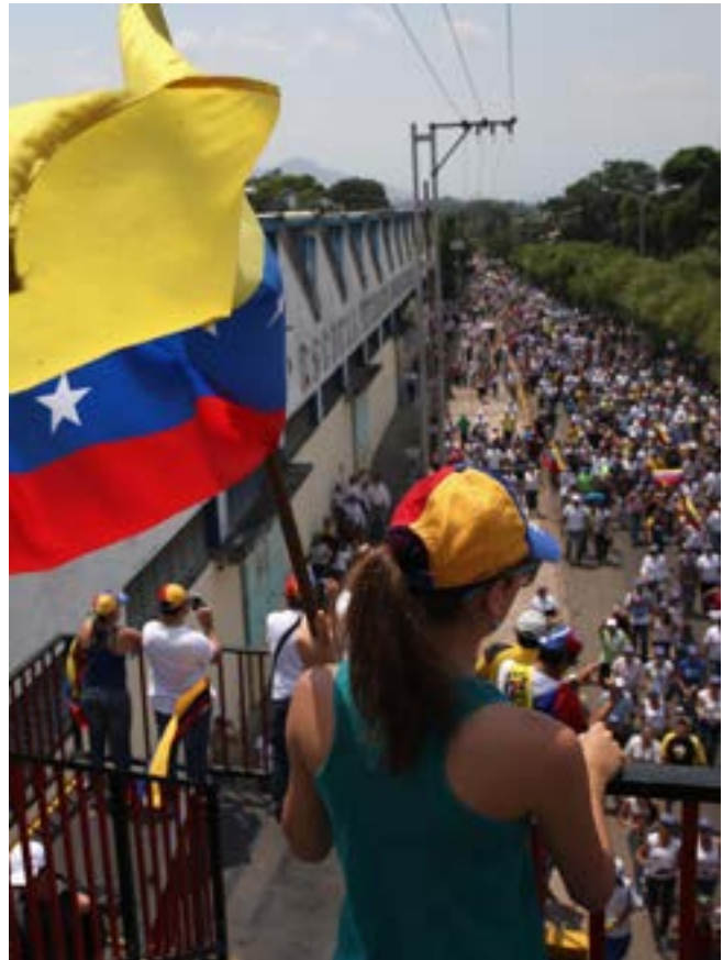
As protests, pictured above, and unrest in Venezuela have mounted and the economic and political situation has deteriorated, Rosneft has offered investment and funding to the Nicolás Maduro government.

Russia's biggest play in vulnerable energy states has been in Venezuela. Following years of mismanagement, Venezuela's economic and political stability has suffered a precipitous decline exacerbated by the 2014 fall in oil prices. Oil production has fallen 30 percent since