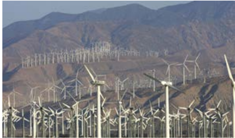
Technological gains are allowing clean energy sources like wind and solar to displace fossil fuels like coal, potentially altering the geopolitics of energy permanently. Pictured above, a wind farm in California.

U.S. energy diplomacy has traditionally focused on access for the United States and its allies to hydrocarbon supply. As Secretary of State Rex Tillerson described it in January 2017, foreign policy should help ensure that the United States and its allies are “not captive to one or a dominant source” of supply. 51 However, in a world of abundant oil supply and low prices, the vulnerabilities associated with oil scarcity are no longer as salient as they once were. In addition, more and more countries are realizing that diversification means much more than increasing optionality for oil imports. Rather, diversification is now also rooted in moving toward technological solutions – now more available and affordable – that shift energy demand away from oil entirely. The development is somewhat counterintuitive, as ordinarily lower oil prices would discourage the development of alternatives to oil. But an overarching focus globally on climate change and air quality concerns has bolstered policy support and popular activism (including shareholder pressure) for off-fossil fuel measures, regardless of the availability of cheaper oil.