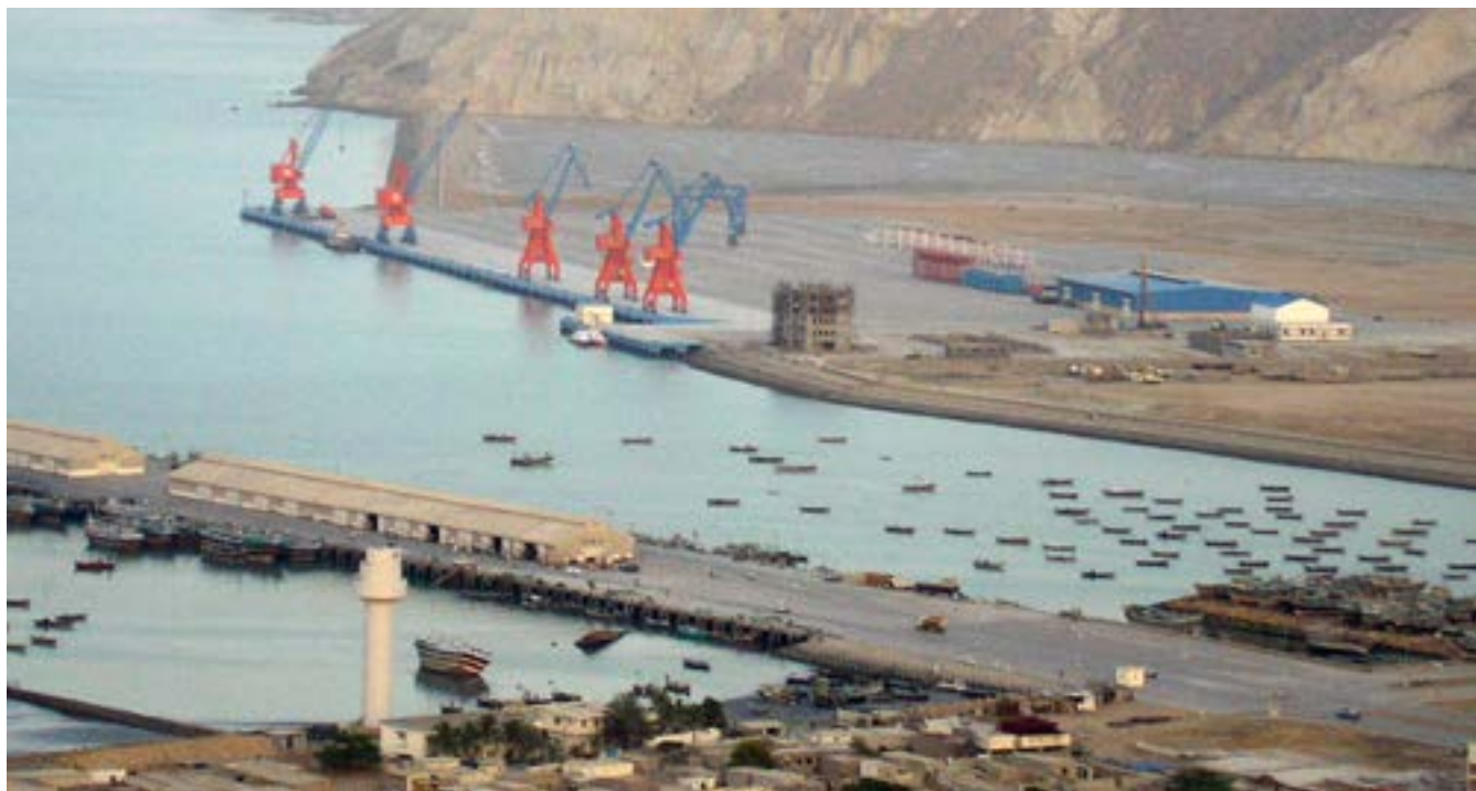
China remains concerned about the expansion in Indian naval power and has sought to build its own ports in the region. Pictured above, the Chinese-operated Gwadar Port in Pakistan.

While China's need for large imports of oil and gas will not diminish in the near future, several factors will blunt its fears about scarcity of supply. These include the end of the urbanization-driven building boom and a shift to a more consumer-based economy, a strong push on the energy efficiency side slowing demand growth, and the United States' shift from the world's largest importer to an oil and gas exporter. Each of these factors has taken