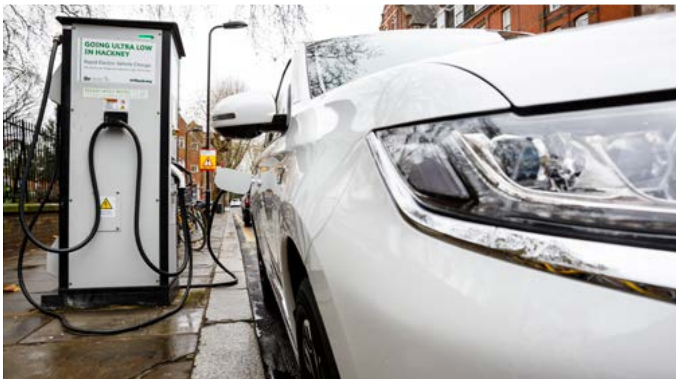
Changes in global oil demand patterns, such as the advent of electric vehicles like the one pictured above, may be ushering in a “lower forever” scenario.

However, in some circumstances, new kinds of low-oil price tensions will emerge and require a rethinking of U.S. strategic priorities around the world. Now is the time to plan for how to reap the benefits of these market developments, as well as reduce geopolitical risk.