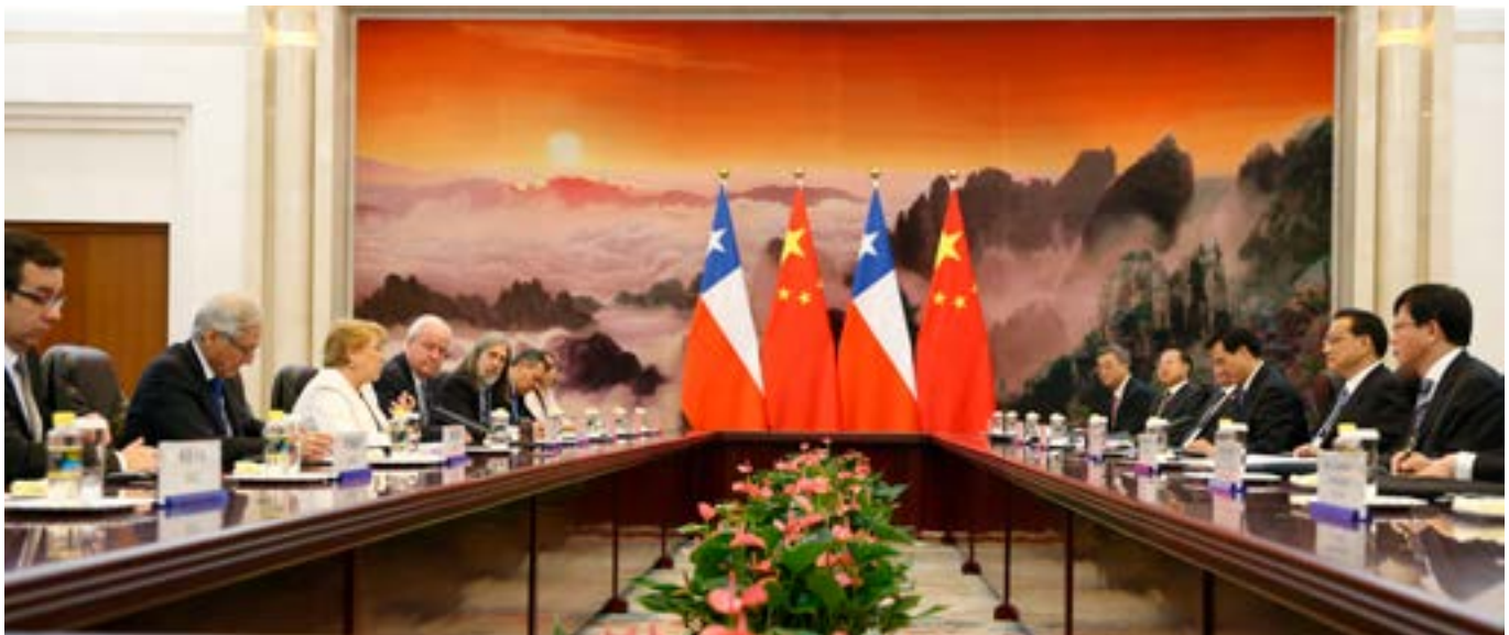
Chinese businessmen have been more eager to invest in peripheral Belt and Road Initiative (BRI) locations like Latin America than traditional BRI geographies in Asia. Pictured above, then-Chilean President Michelle Bachelet meets Chinese Premier Li Keqiang for a BRI summit.

The implications of the new lower-price environment are increasingly entering the U.S. foreign policy debate concerning China. O'Sullivan argues that "[i]n this instance, what is good for China has largely been good for the rest of the world and for the United States in particular." She supports increased U.S.–China collaboration on energy given that "the current global energy situation does weigh definitively in favor of China's continued adherence to the broad contours of existing institutions." The Atlantic Council's Gal Luft is explicit about encouraging the United States to participate constructively in BRI, especially where it dovetails with the administration's pre-existing energy priorities. 47