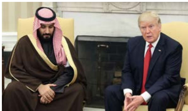
President Donald Trump, pictured above with Saudi Crown Prince Mohammed bin Salman, has put considerable effort into reassuring Middle Eastern allies of continued American support, even as lower prices have created opportunities for disengagement.

Lower oil prices have created an opportunity for some level of U.S. disengagement from the Middle East.